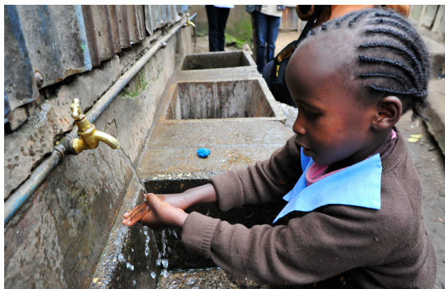
A school girl cleaning her hands during break time Nairobi, Kenya.

To get slum households out of slum conditions, focused and integrated investments need to be made towards improvement of access to potable water, sanitation, quality of housing, access to healthcare, education facilities, security of tenure, employment and public space. The level and nature of intervention by different actors should be aimed towards the reduction or improvement of slum households and enable the sustainable transformation slum neighbourhoods driven by slum dwellers.