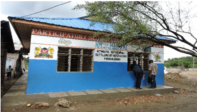
PSUP community resource centre in Mtwapa Kenya.

Good partnerships are the critical element to support the multiplier effect of participatory slum upgrading. The Participatory Slum Upgrading Programme (PSUP) consists of several levels of partnerships. Globally the partnership is anchored by a tripartite partnership with the European Commission and the ACP Secretariat as well as the 79 Member States of the ACP Countries. The visibility and knowledge platform has built trust and encouraged countries beyond ACP borders to join the programme. UN-Habitat is building a regional knowledge and capacity hub in the Arab States which will facilitate expansion to countries like Egypt, Iraq, Jordan and Lebanon, and there are current expressions of interest for informal settlement upgrading in Indonesia, India, Myanmar, Pakistan and Thailand.