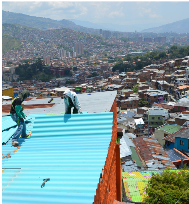
Men building their roof in Medellin, Colombia.

An investment of 200 million Euros in PSUP could address the needs of an estimated 35 million slum dwellers in ACP Countries over five years, more than double that achieved in the improvement of living conditions against the MDG 7d for Africa in 15 years. Moreover, UN-Habitat expects to expand its resource bases more broadly even when not directly managing investments in informal settlements. Just in Ghana and Kenya, the World Bank will invest around 100 million US dollars over 15 years, and the PSUP is a prime tool for SDG achievement.