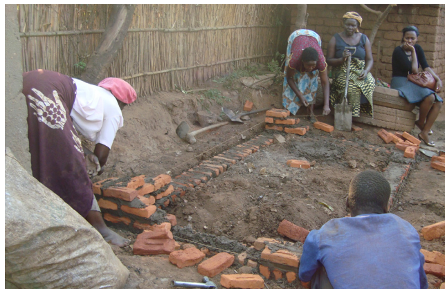
Gamashie Community road during upgrading.

Coordination mechanisms and urban forums have been established in more than 30 countries. National Urban Development and Slum Upgrading and Prevention Policies have been developed and approved in Burkina Faso, Cameroon, Cape Verde, Fiji, Kenya, Ghana, Papua New Guinea and Uganda. More than 800,000 slum dwellers now have secure tenure in Burkina Faso, Cameroon, DR. Congo, Ghana, Kenya, Malawi, Mozambique, Niger and Senegal). Around 67,600 slum households will see improved water and sanitation, better housing, access to public spaces and better roads.